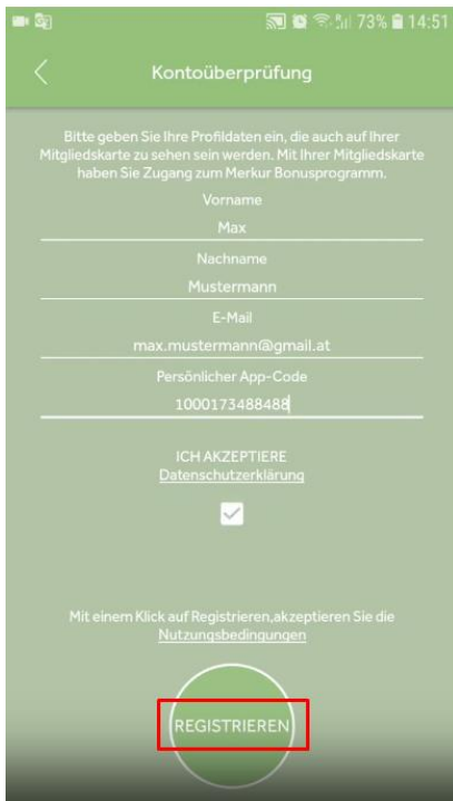
Step 5: Register