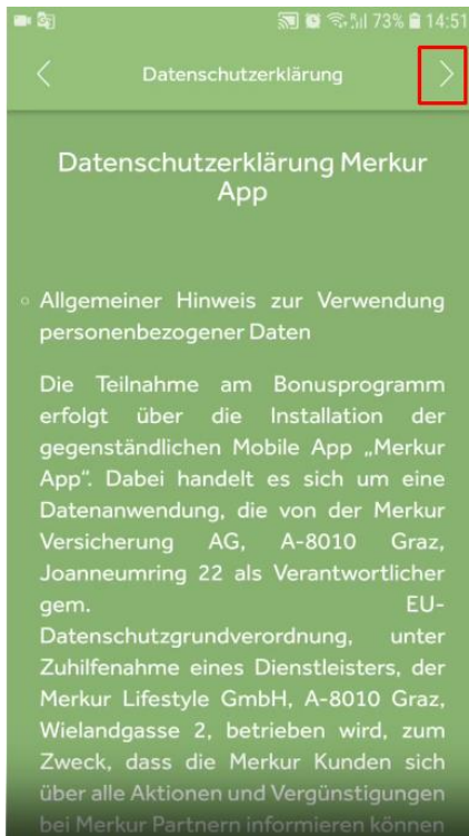
Step 3: Read privacy policy.