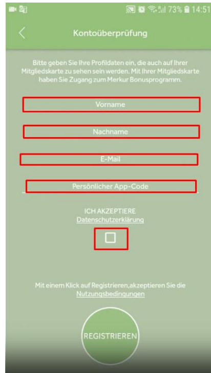
Step 4: Enter your date. First name, surname, e-mail address and personal app-code.