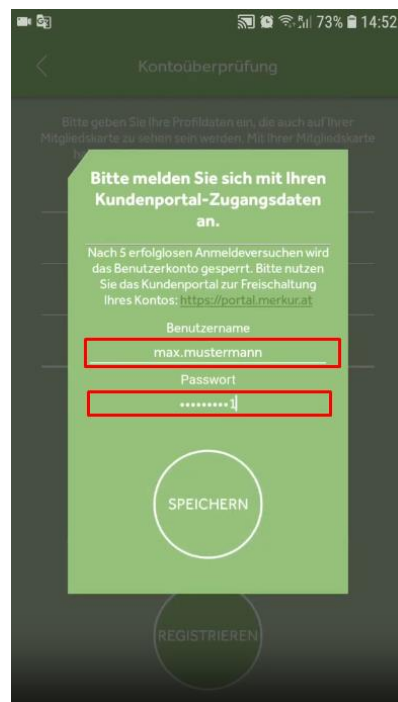
Step 6: Enter your Merkur portal name and Merkur portal password.